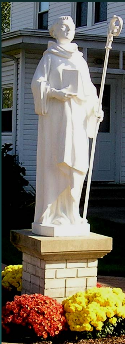
St. Bernard of Clairvaux